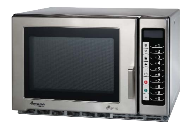
Model RFS12TS shown